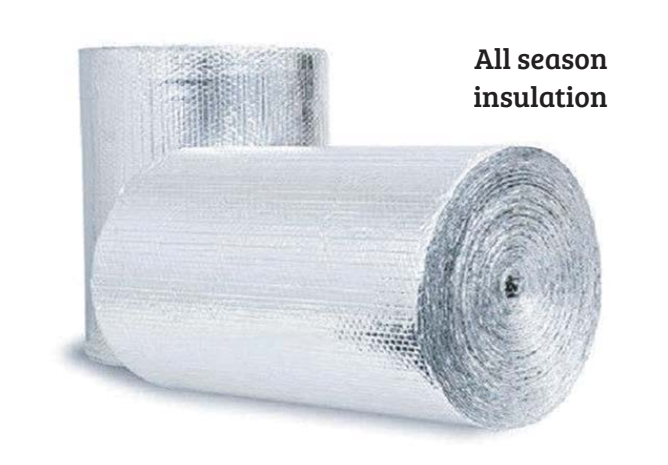
All season insulation