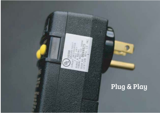
Plug & Play