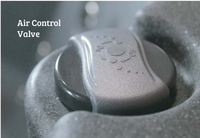
Air Control Valve