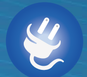
Plug 120V (convertible 240V)*