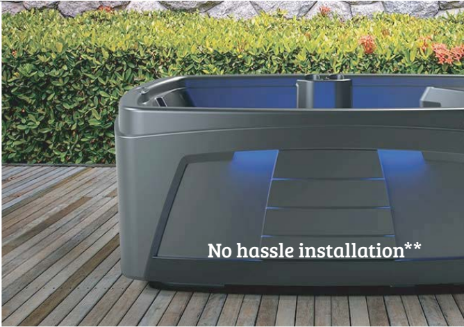
No hassle installation**