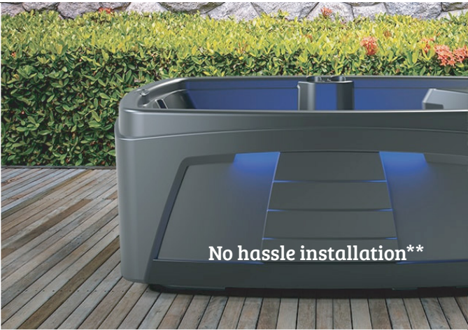
No hassle installation**