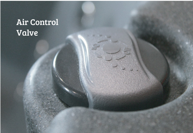
Air Control Valve