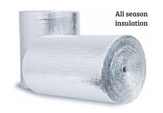
All season insulation