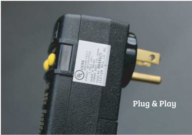
Plug & Play